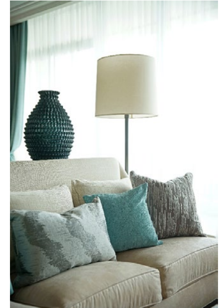
Residential Project Jakarta, Indonesia