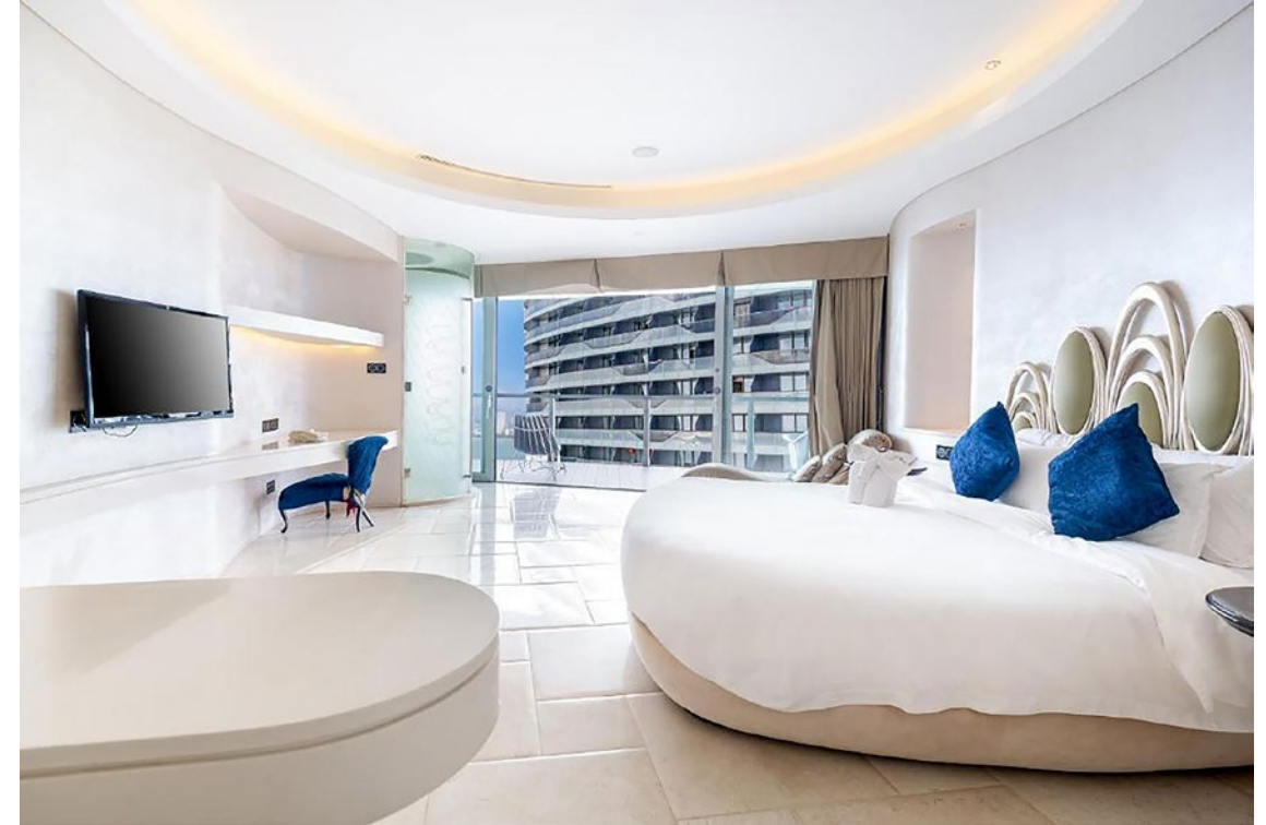
Sanya Phoenix Island China