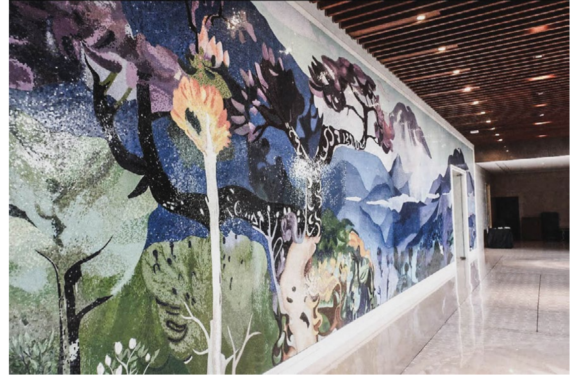
Raffles Hotel Jakarta, Indonesia