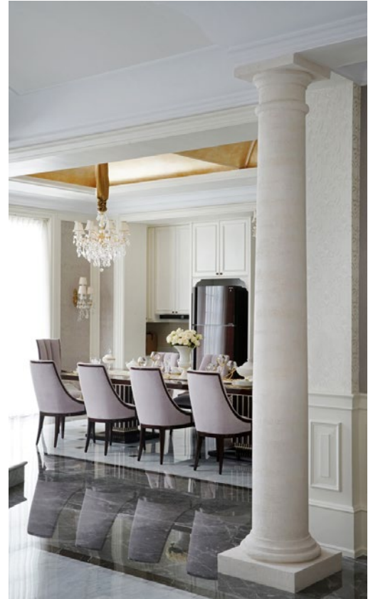
Residential Project Jakarta, Indonesia