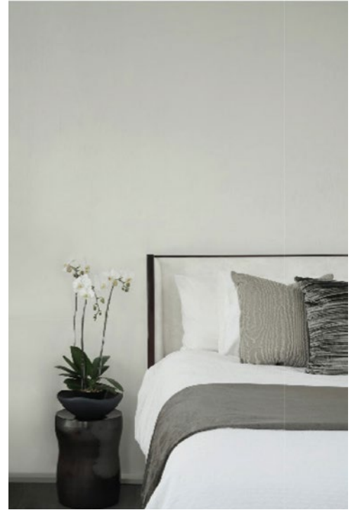
Residential Project Jakarta, Indonesia