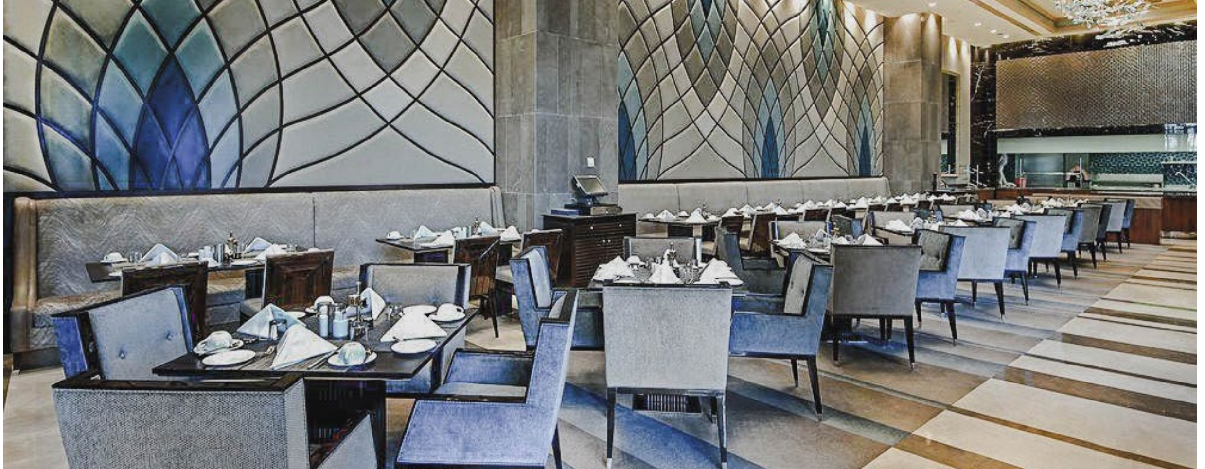
Hilton Bursa Turkey