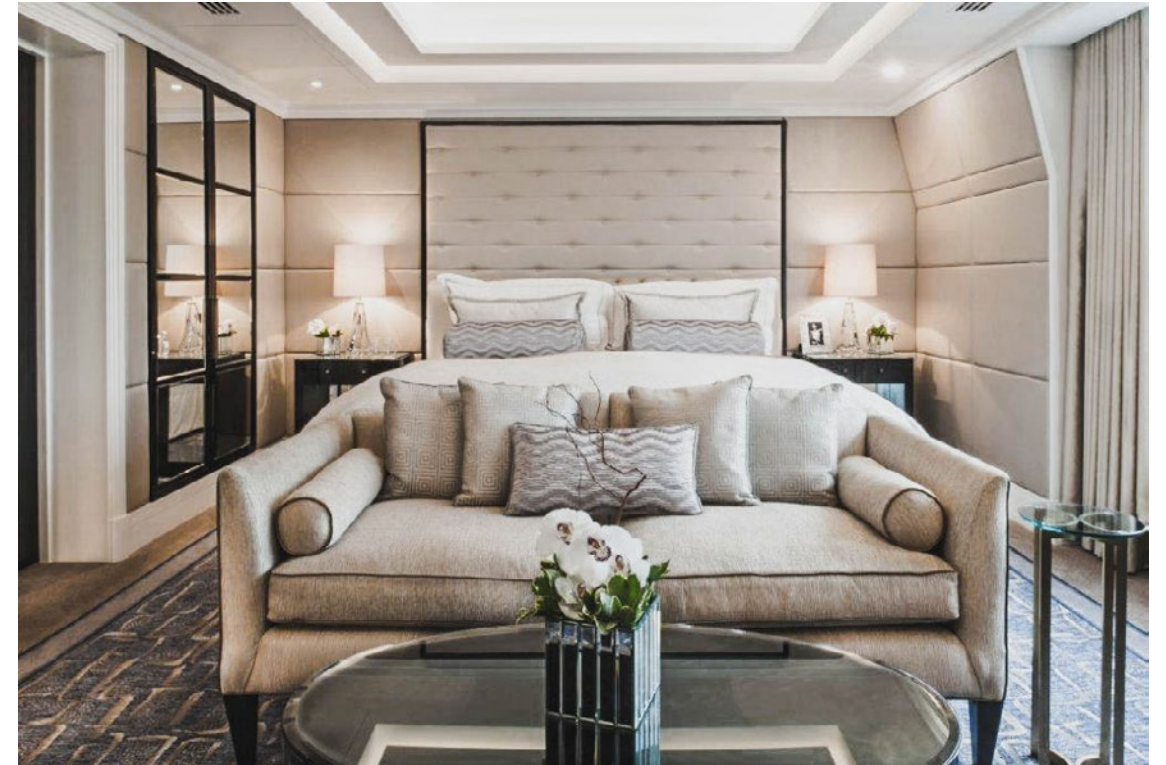
Wellesley Hotel Westminster, London