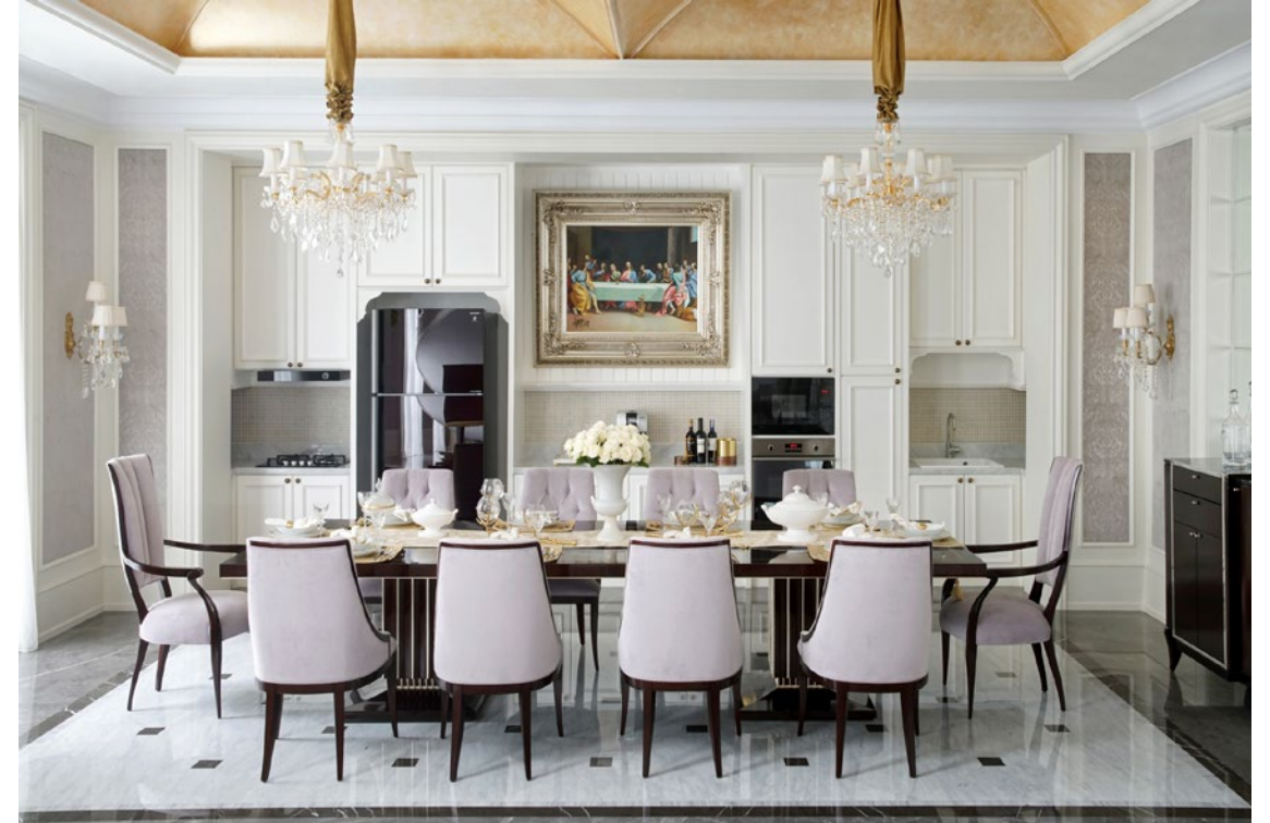
Residential Project Jakarta, Indonesia