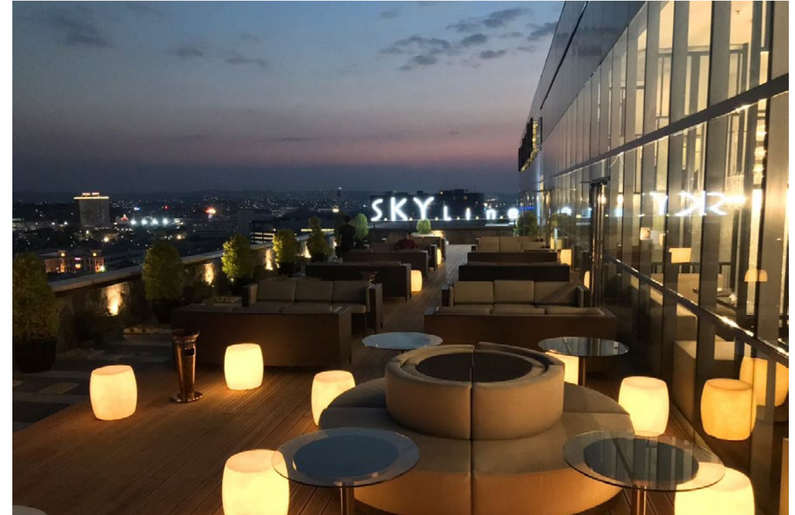
Gumaya Tower Hotel Semarang, Indonesia