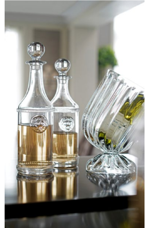
Residential Project Jakarta, Indonesia