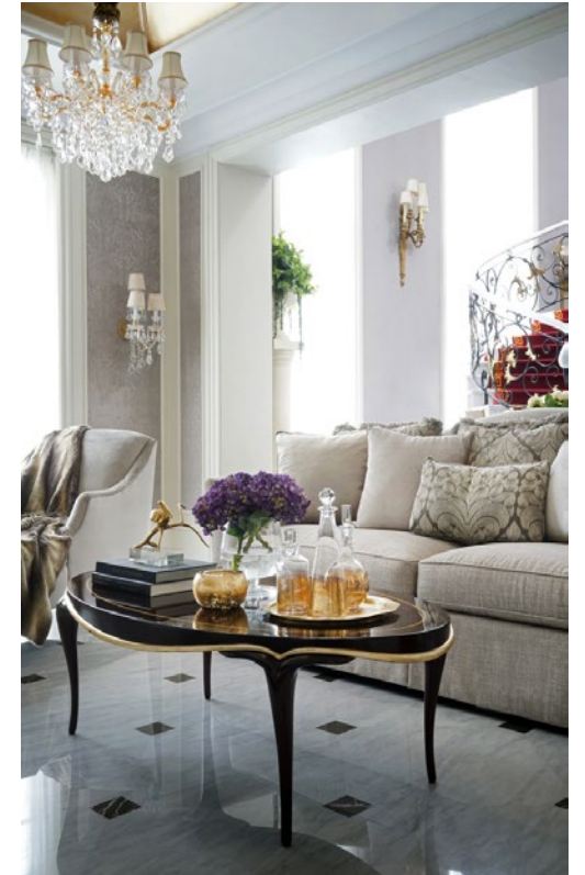
Residential Project Jakarta, Indonesia