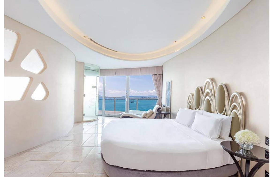
Sanya Phoenix Island China