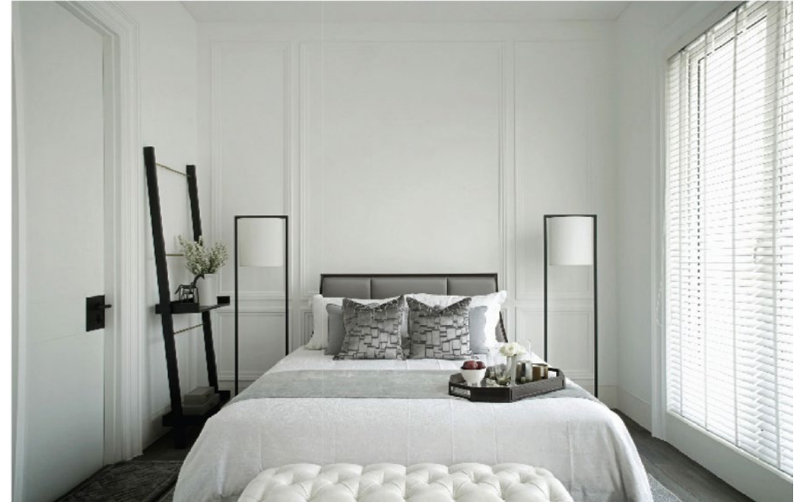
Residential Project Jakarta, Indonesia